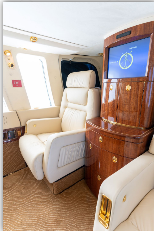
AFT FACING VIP CLUB SEATS

Contact Kevin White for further information | kwhite@jetedgepartners.com | +1-410-928-4022 | www.jetedgepartners.com