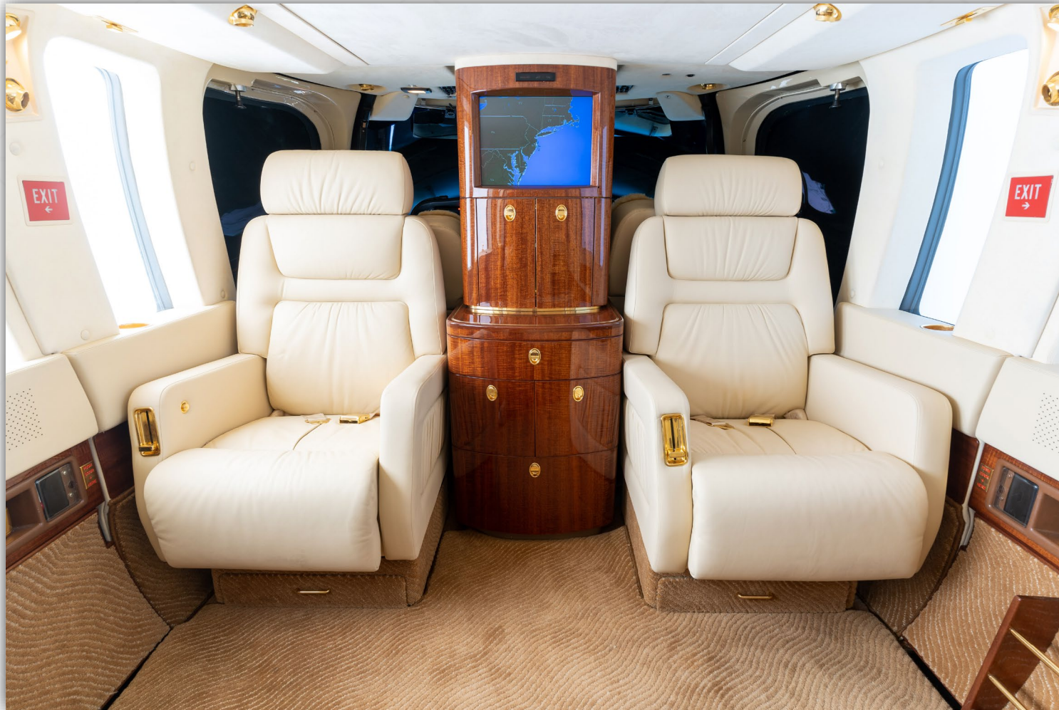
MAIN CABIN LOOKING FORWARD

Contact Kevin White for further information | kwhite@jetedgepartners.com | +1-410-928-4022 | www.jetedgepartners.com