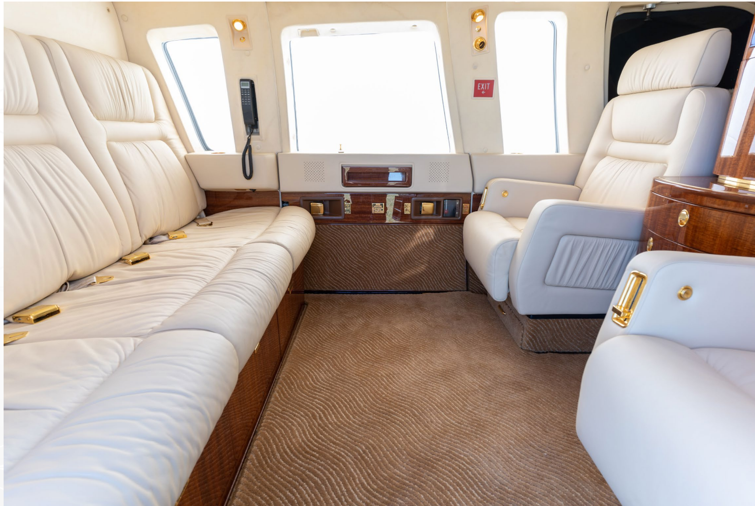
MAIN CABIN LOOKING PORT SIDE

Contact Kevin White for further information | kwhite@jetedgepartners.com | +1-410-928-4022 | www.jetedgepartners.com