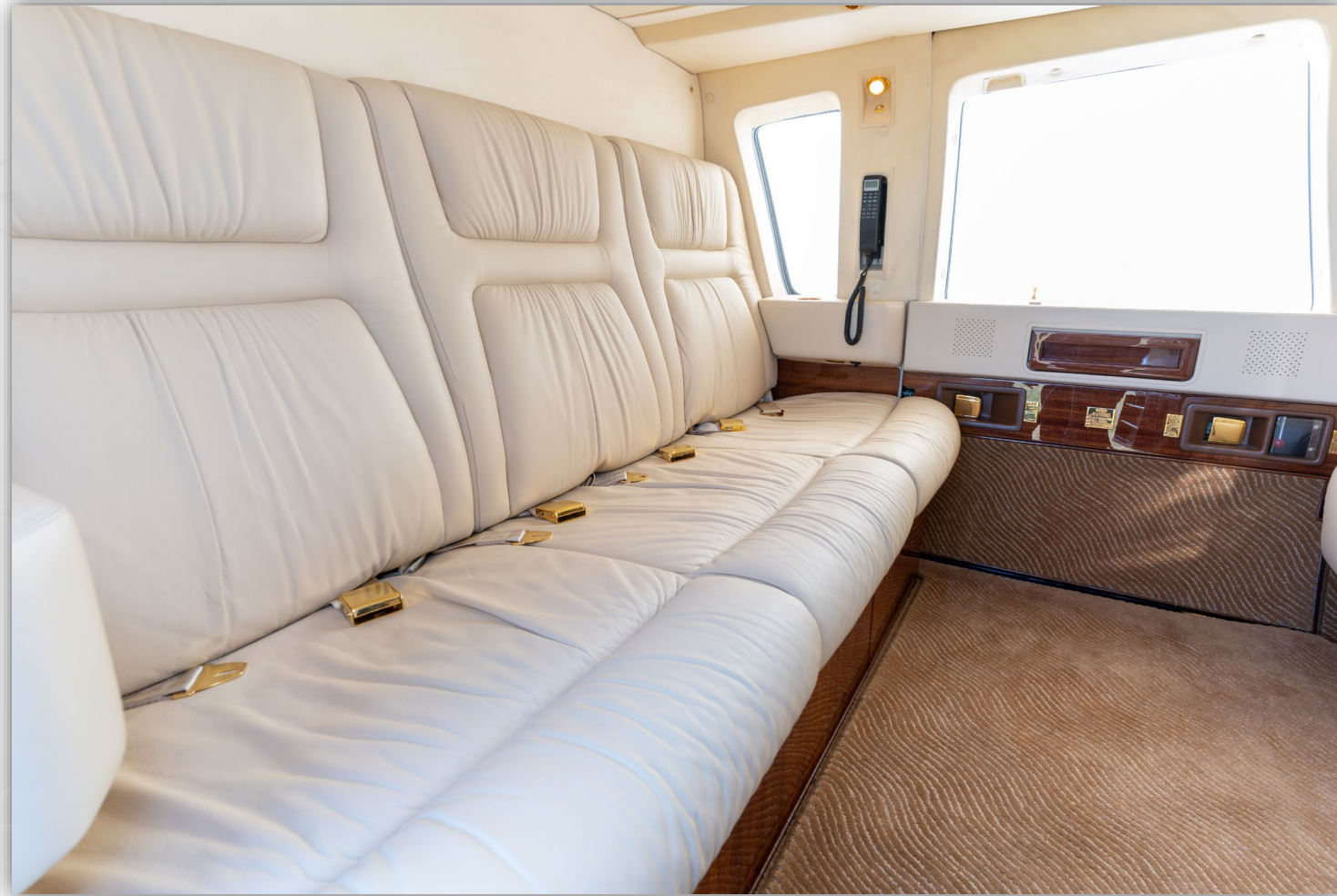
MAIN CABIN DIVAN